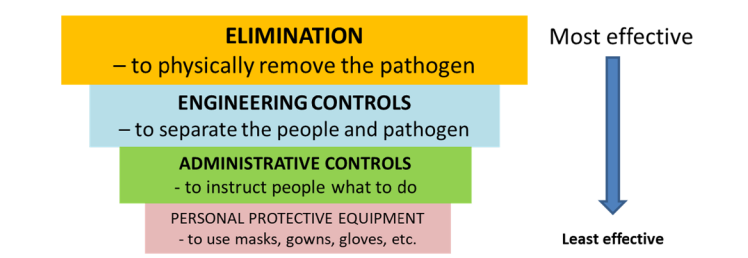
Fig. 1. Traditional infection control pyramid adapted from the US Centers for Disease Control (CDC, 2015).

required to demonstrate airborne transmission is so much higher than for these other transmission modes (Morawska et al., 2020).